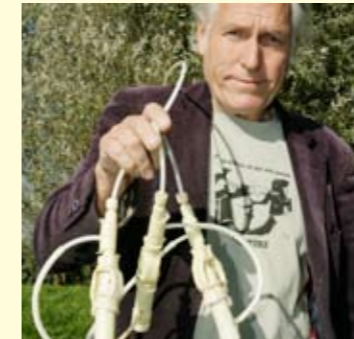
← This is the device named "a liar" by Jansen. (3 liars)

The point is that the separate condition of each valve is different. They are "1" "0" "1" or "0" "1" "0". If they are "0" "0" "0" or "1" "1" "1", the unit does not work. I call this outcome "a liar" because it lies and gives a false signal to