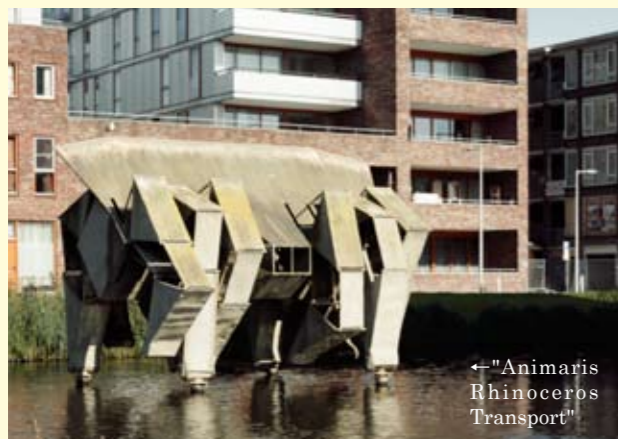
← "Animaris Rhinoceros Transport"

I use special, thin tubes made of P.V.C. as well because there are no standbys. I usually have to order them directly from the company or factory.