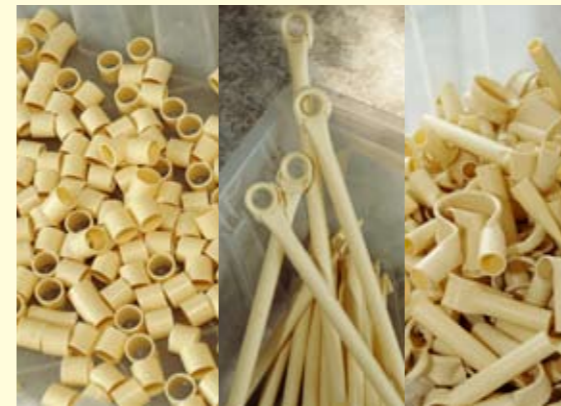
↑ many kinds of cutting tubes