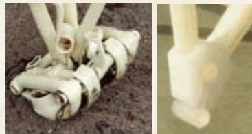
↑ The left side is the top of the leg of "Strandbeest". The right side is a miniature "beest"s.

Theo : These tubes are very common in Holland and are easy to find almost anywhere. Children