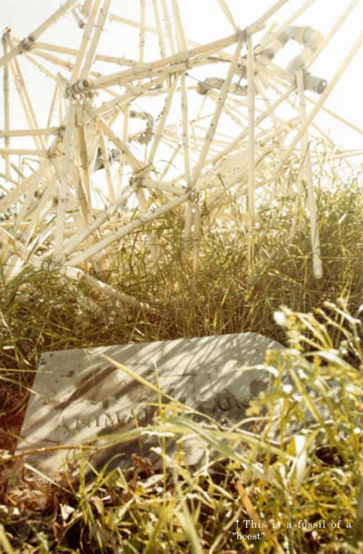
↑ This is a fossil of a "beest".