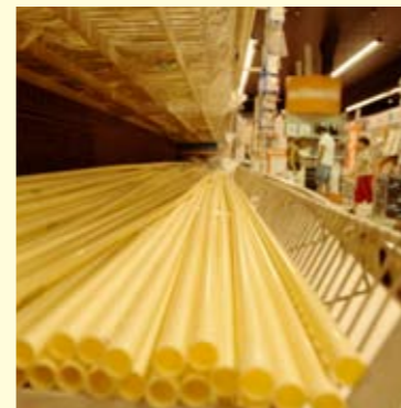
→Yellow tubes are sold in shops in Holland.