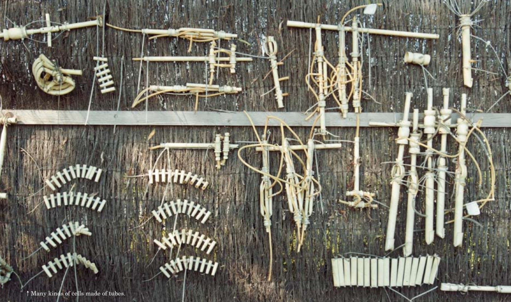
↑ Many kinds of cells made of tubes.