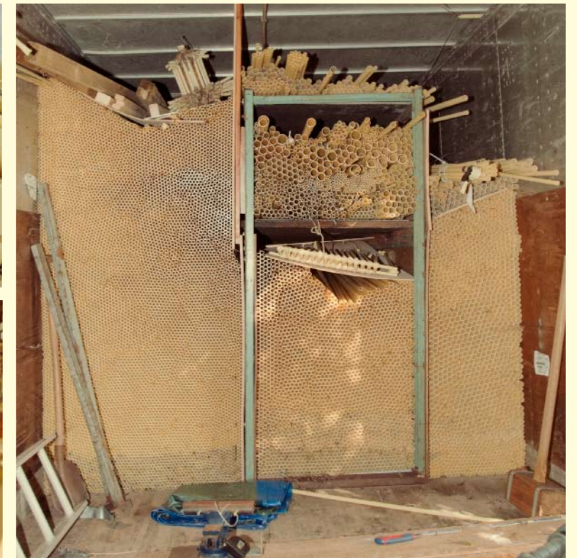
↑ The garage is filled up with tubes .