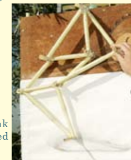
→ This is the link mechanism called "Jansen's link".